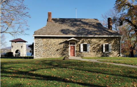
Washington's Headquarters, Newburgh New York State Office of Parks, Recreation and Historic Preservation

New Yorkers met at the Senate House in Kingston in 1777 and formed a new governmental system that continues to guide the state today. The patriots thwarted British attempts at controlling the Hudson by fortifying the Hudson Highlands at West Point and installing two massive chains across the river.