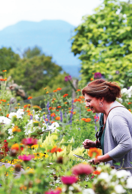
Garden at Olana, Hudson