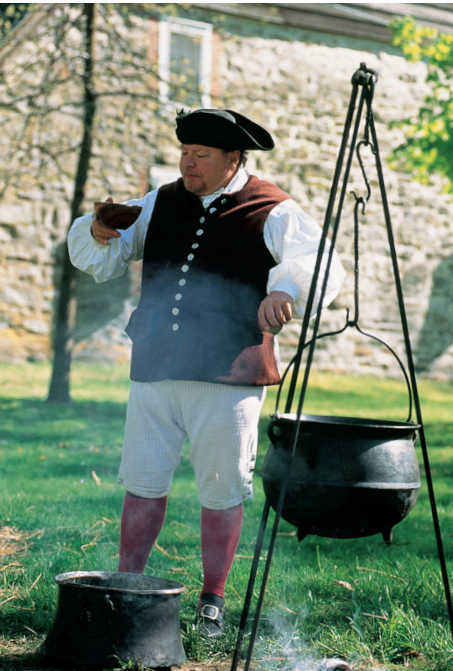
Huguenot Street, New Paltz