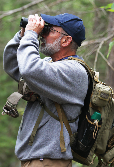
Birding at Slabsides, West Park

America's vision of itself as a wild, untamed wilderness is rooted artistically in the Hudson River Valley. Varying in style from the realistic to the allegorical, Thomas Cole, Asher Durand, Frederic Church, and many other 19th century artists depicted landscapes with a dramatic sense of light and atmosphere. Cole's home and studio in Catskill and Church's Olana estate, near Hudson, offer