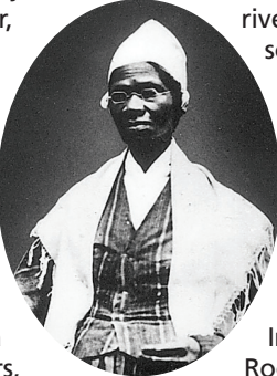
Sojourner Truth Sojourner Truth Library SUNY at New Paltz

In October 1782, a year after the British surrendered at Yorktown, Gen. George Washington moved his army of 7,000 men to New Windsor, where the soldiers lived in log huts until June 1783. Maj. Gen. Henry Knox moved into the Ellisons' house nearby while Washington established his headquarters at the Hasbroucks' farmhouse in Newburgh. It was there that Washington defused a potential mutiny by officers, made plans to disband the army, and awarded three badges of Military Merit that would become the Purple Heart in the 20th century.