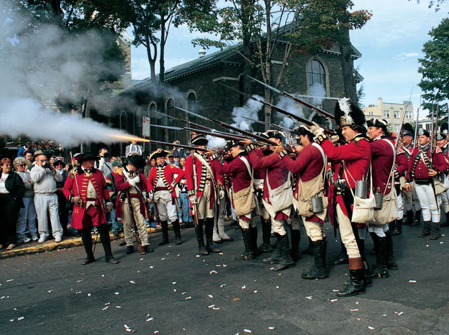
Revolutionary War reenactors at Kingston