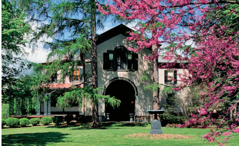
Samuel Morse's Locust Grove, Poughkeepsie

border of New York City is a partnership of local, state, and federal sites with the Hudson River Valley Greenway serving as its manager. The National Park Service provides technical and financial support. For information on these events and other projects of the National Heritage Area, please visit www.hudsonrivervalley.com .