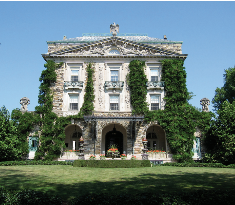
Kykuit, Tarrytown Gryffindor

border of New York City is a partnership of local, state, and federal sites with the Hudson River Valley Greenway serving as its manager. The National Park Service provides technical and financial support. For information on these events and other projects of the National Heritage Area, please visit www.hudsonrivervalley.com .