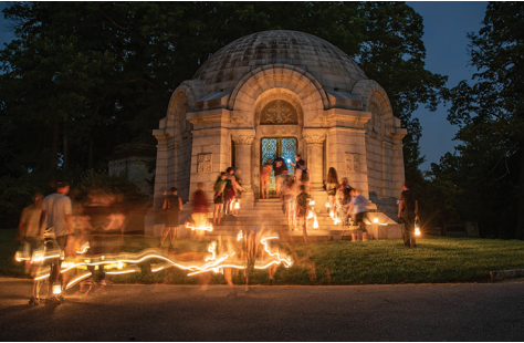
Sleepy Hollow Cemetery, Sleepy Hollow Sleepy Hollow Cemetery

The Maurice D. Hinchey Hudson River Valley National Heritage Area was established by Congress in 1996 to recognize, preserve, protect, and interpret the nationally significant history and resources of the valley for the benefit of the nation. This four-million-acre heritage area between Waterford and the northern