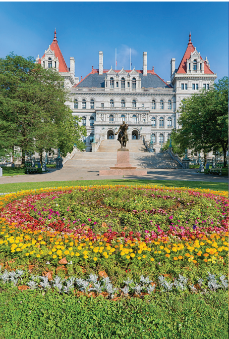
State Capitol, Albany