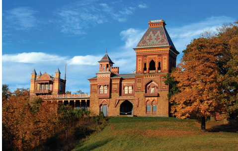
Olana, Hudson

America's vision of itself as a wild, untamed wilderness is rooted artistically in the Hudson River Valley. Varying in style from the realistic to the allegorical, Thomas Cole, Asher Durand, Frederic Church, and many other 19th century artists depicted landscapes with a dramatic sense of light and atmosphere. Cole's home and studio in Catskill and Church's Olana estate, near Hudson, offer