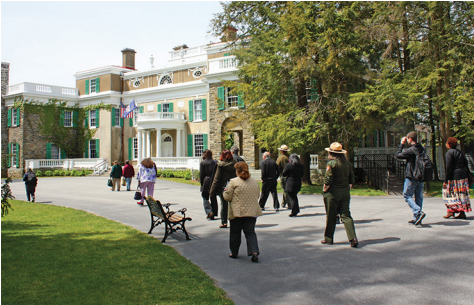
Springwood, Franklin D. Roosevelt's home, Hyde Park

In the 20th century, President Franklin D. Roosevelt led the United States out of the Great Depression and through the turmoil of World War II. Roosevelt was born at Springwood, the family estate in Hyde Park. Though it remained his lifelong home, Roosevelt felt the need for greater privacy and solitude while he was President and