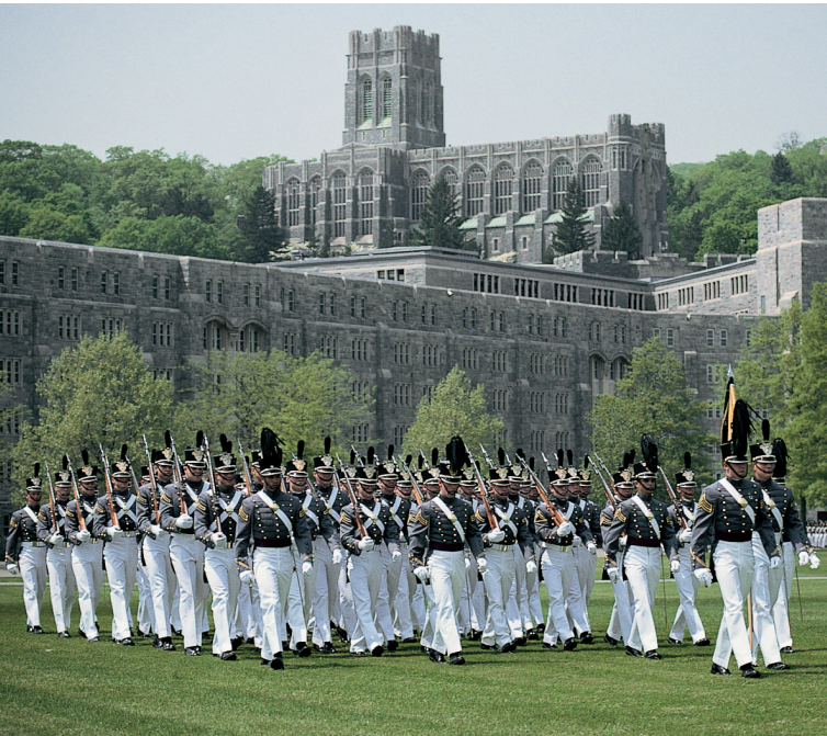
U.S. Military Academy, West Point