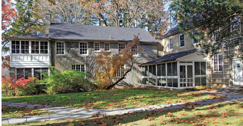
Val-Kill, Eleanor Roosevelt's retreat, Hyde Park National Park Service

Park retreat. She closed the factory in 1936 and converted it into a residence, which she called Val-Kill Cottage. After her husband died, she lived there for 17 years while engaged in her humanitarian causes. Next to Springwood is the first presidential library, the Franklin D. Roosevelt Library and Museum, which celebrates the legacies of Franklin and Eleanor Roosevelt through its extensive collections and informative exhibits.