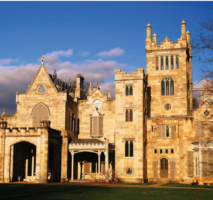
Lyndhurst, Tarrytown