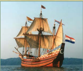
Henry Hudson's "Halve Maen" (Replica)

The Hudson River Valley Greenway / Hudson River Valley National Heritage Area E-Newsletter is published monthly And emailed to friends of the Hudson River Valley.