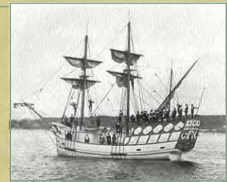
Samuel Champlain's "Don de Dieu" (Replica)