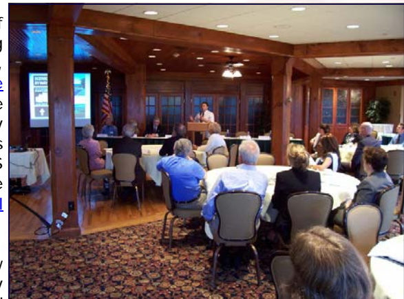
Joint Board Meeting at Mohonk