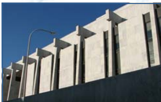
Swan Street Building

Despite its modernist appearance, one of Albany's largest structures was inspired by ancient Egyptian architecture. Wallace Harrison, principal architect of the Empire State Plaza, based his design of the quarter mile long Swan Street building on Pharaoh Hatshepsut's Temple at Deir el-Bahri, Egypt.