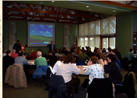
Heritage Sites and Tourism Partners Participate in the January 18th NHA Workshop