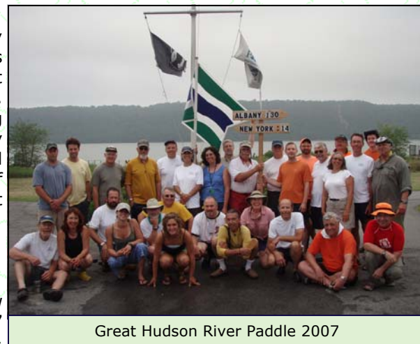
Great Hudson River Paddle 2007