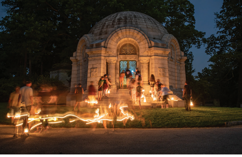
Sleepy Hollow Cemetery, Sleepy Hollow Sleepy Hollow Cemetery

The Maurice D. Hinchey Hudson River Valley National Heritage Area was established by Congress in 1996 to recognize, preserve, protect, and interpret the nationally significant history and resources of the valley for the benefit of the nation. This four-million-acre heritage area between Waterford and the northern