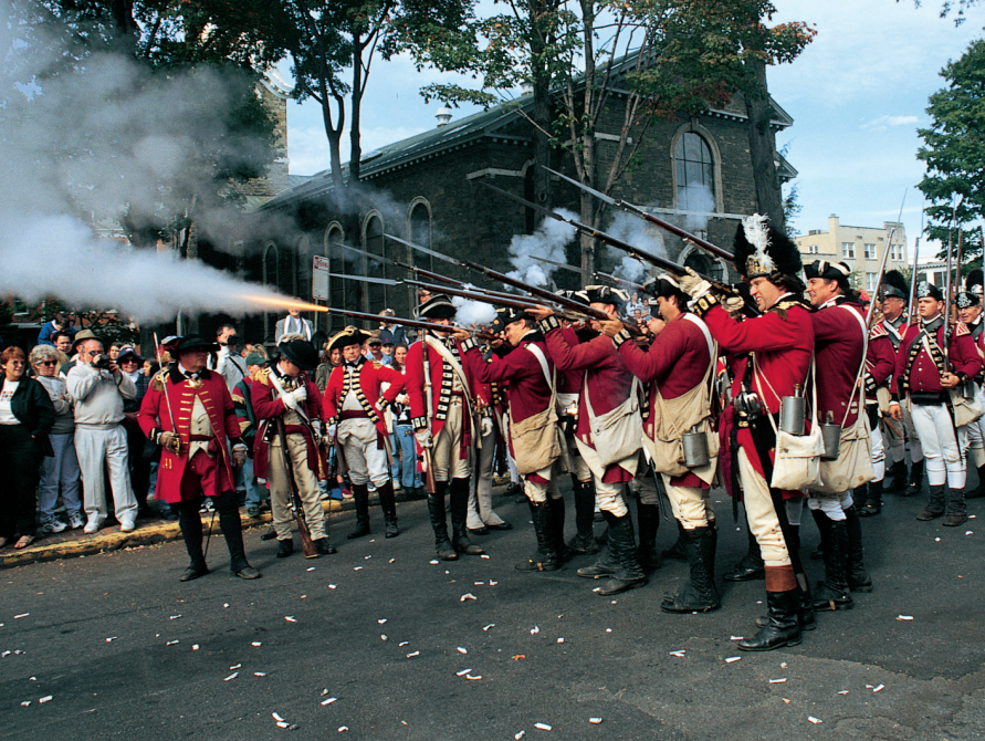
Revolutionary War reenactors at Kingston