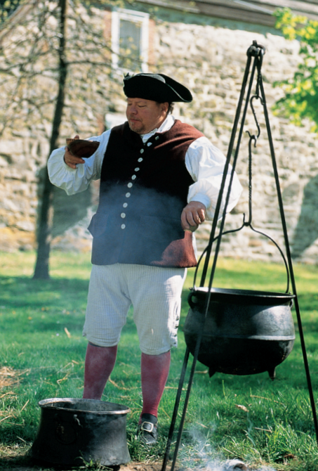
Huguenot Street, New Paltz