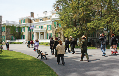
Springwood, Franklin D. Roosevelt's home, Hyde Park

In the 20th century, President Franklin D. Roosevelt led the United States out of the Great Depression and through the turmoil of World War II. Roosevelt was born at Springwood, the family estate in Hyde Park. Though it remained his lifelong home, Roosevelt felt the need for greater privacy and solitude while he was President and