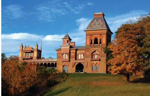
Olana, Hudson

America's vision of itself as a wild, untamed wilderness is rooted artistically in the Hudson River Valley. Varying in style from the realistic to the allegorical, Thomas Cole, Asher Durand, Frederic Church, and many other 19th century artists depicted landscapes with a dramatic sense of light and atmosphere. Cole's home and studio in Catskill and Church's Olana estate, near Hudson, offer