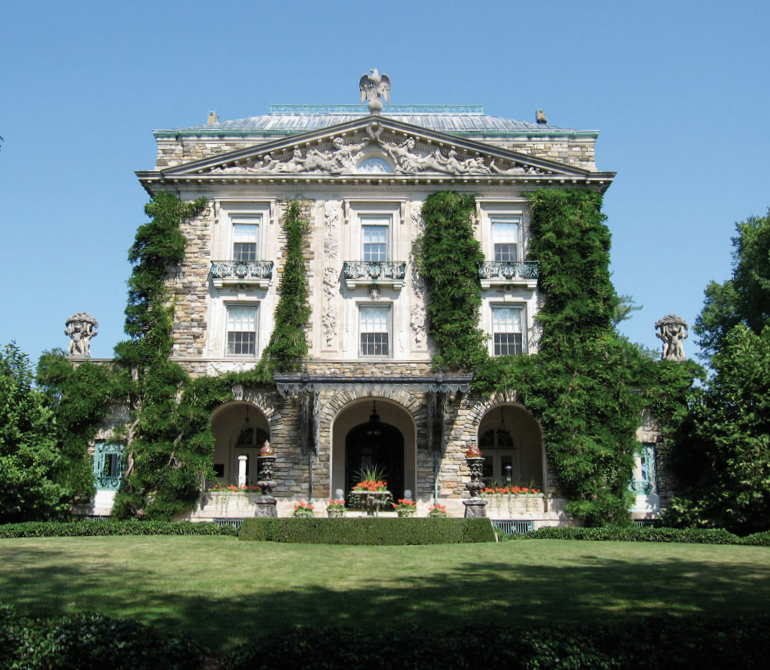
Kykuit, Tarrytown Gryffindor

border of New York City is a partnership of local, state, and federal sites with the Hudson River Valley Greenway serving as its manager. The National Park Service provides technical and financial support. For information on these events and other projects of the National Heritage Area, please visit www.hudsonrivervalley.com .