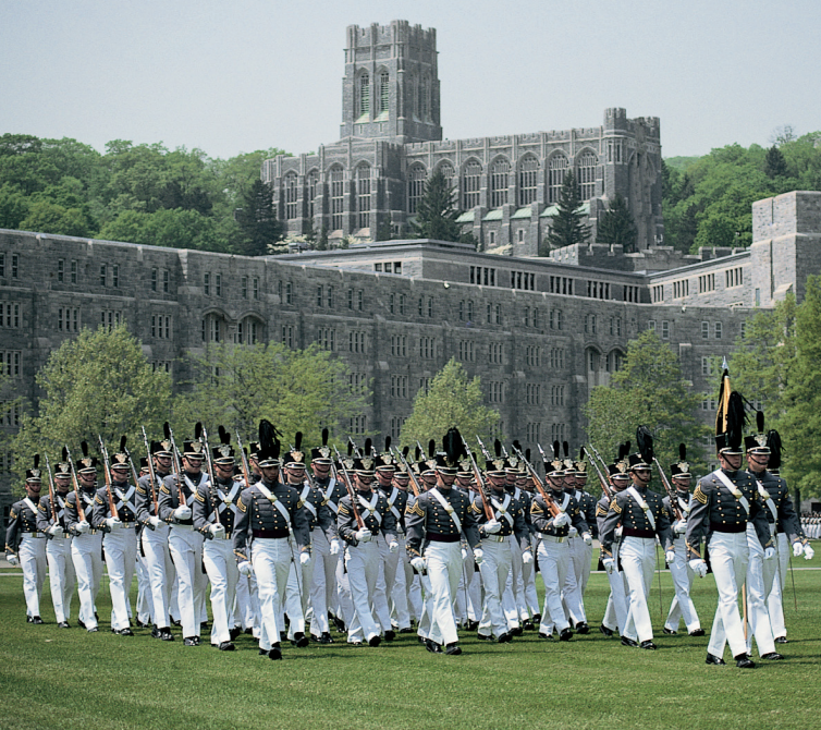
U.S. Military Academy, West Point