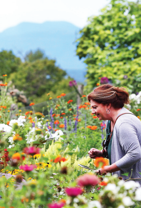
Garden at Olana, Hudson