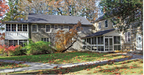
Val-Kill, Eleanor Roosevelt's retreat, Hyde Park

Park retreat. She closed the factory in 1936 and converted it into a residence, which she called Val-Kill Cottage. After her husband died, she lived there for 17 years while engaged in her humanitarian causes. Next to Springwood is the first presidential library, the Franklin D. Roosevelt Library and Museum, which celebrates the legacies of Franklin and Eleanor Roosevelt through its extensive collections and informative exhibits.