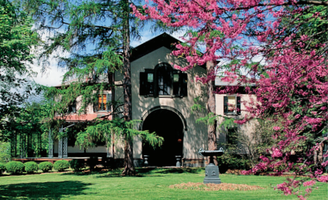
Samuel Morse's Locust Grove, Poughkeepsie

border of New York City is a partnership of local, state, and federal sites with the Hudson River Valley Greenway serving as its manager. The National Park Service provides technical and financial support. For information on these events and other projects of the National Heritage Area, please visit www.hudsonrivervalley.com .