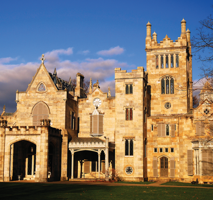
Lyndhurst, Tarrytown